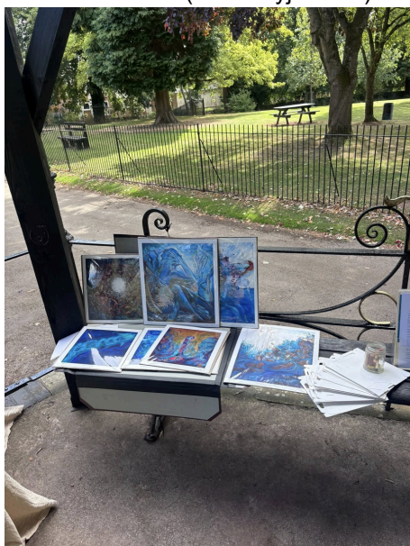
Grace Engel Arts