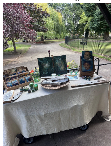
Grace Engel Arts